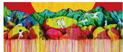
THE CABIN COMPANY (Children and Hall's Hymn) 2023

THE CABIN COMPANY is a duo of picture book writers & artists Kentaro Abe and Saki Yoshioka, who utilise a closed school in Oita Prefecture as their studio, where they create a variety of works on a daily basis. The exhibition displays the full range of their creative activities, including more than 40 picture books, three-dimensional works and stage art, which they have been producing since the unit was formed in 2009.