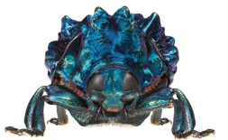
Focus stacking photo: Fulcix coelestina