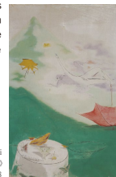
Sakan Taguchi (A Moment in the Season) 1938

In line with the exhibition: '120th anniversary of the birth of Salvador Dali', this exhibition introduces artworks from the collection that capture the inner spirit of the human mind.