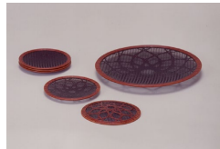
Chikuyu Uematsu (Set of Plates, "Kego" pattern) 1977

This special exhibition (vol. 8 - held only once in 2024) showcases bamboo crafts from a variety of perspectives and introduces its history.