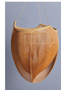
Shounsai Shono (Flame) 1957

Shounsai Shono was the first living National Treasure in the field of bamboo art. This exhibition commemorates the 120th anniversary of his birth and the 50th anniversary of his death, presenting a complete overview of his work. Introducing the development of a wide range of his styles - from his early works in the Chinese style, to more technical works that incorporate comb-weaving into classical compositions, the exhibition also features sculptural works that boldly use this technique, and others from his later years that utilise the simple beauty of bamboo.