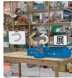
Untitled (Making #235), 2021 © Gottingham Image courtesy of TASKO and Studio Xxingham