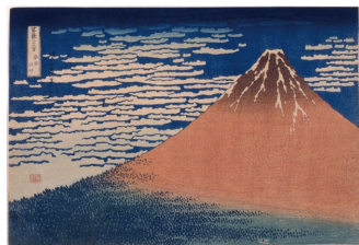
Hokusai Katsushika (South Wind, Clear Sky, also known as Red Fuji, from the series Thirty-six Views of Mount Fuji) 1831-33, Edo-Tokyo Museum

Hokusai Katsushika's Fugaku Sanjurokkei (Thirty-six Views of Mount Fuji) had an strong impact on people with its vivid colours and bold composition. How did Hiroshige go on to develop his own style in the shadow of Hokusai's huge success? This exhibition introduces the relentless challenges of Hokusai and Hiroshige - two of the greatest landscape painters of all time, through an invaluable collection from the Edo-Tokyo Museum.