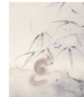
Shunpo Yukimatsu (Clear Evening) Early Showa era

The Japanese have always had a profound love for anything 'kawaii' ('cute', 'adorable'). This section explores the charm found within each displayed work by laying emphasis on aspects bound to make you smile - including birds, animals, plants and flowers, as well as small, simple objects.