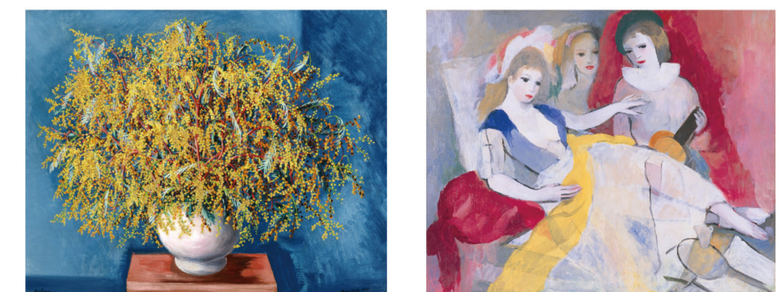
Moïse Kisling 《Mimosa》 1945

Additionally, to commemorate 30 years since the designation of Oita Pottery as an Important Intangible Cultural Property, the exhibition spotlights Oita's traditional crafts.