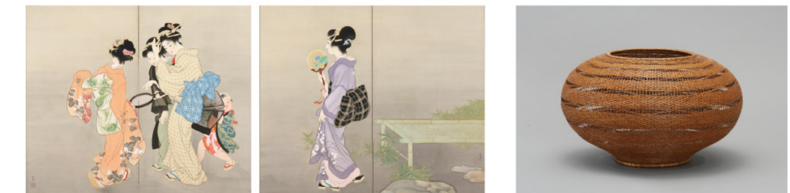
UEMURA Shoen 《Evening of Lunar Eclipse》 1916